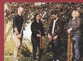
FERIO SAXOPHONE QUARTET